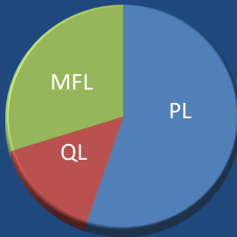
Fish Landing Stage